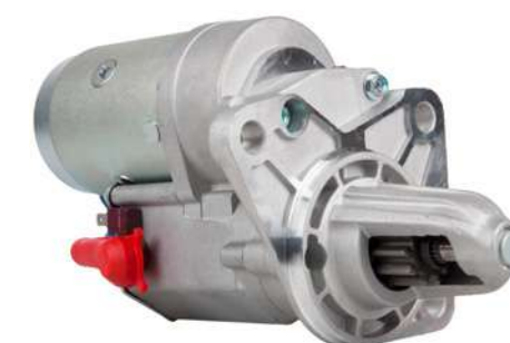
MITSUBISHI / MANDO TYPE